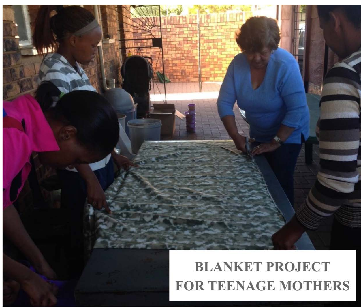
BLANKET PROJECT FOR TEENAGE MOTHERS